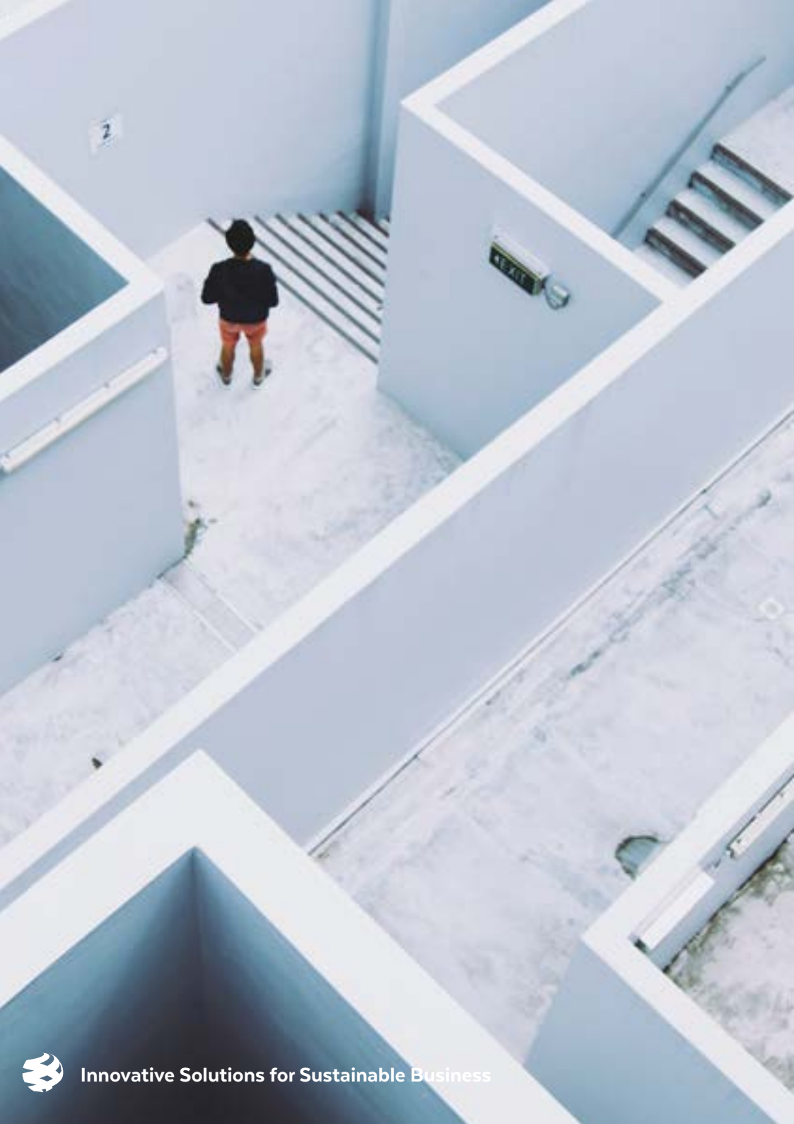
CHART YOUR PATH TO NET ZERO WITH CARBON INSIGHTS

WE KNOW THAT STARTING YOUR NET ZERO JOURNEY CAN BE DAUNTING, BUT YOU DON'T HAVE TO TACKLE IT ALL AT ONCE!